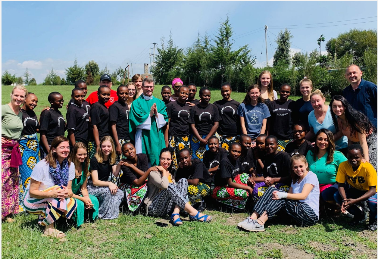
Pictured above is the 2019 Commissioned by Christ Kenya Mission team together with the Mercy Girls liturgical dancers.

A number of participatory discussions and group exercises with the Mercy Girls and the missionaries helped focus on cooperation, fun, faith and building a positive faithful community.