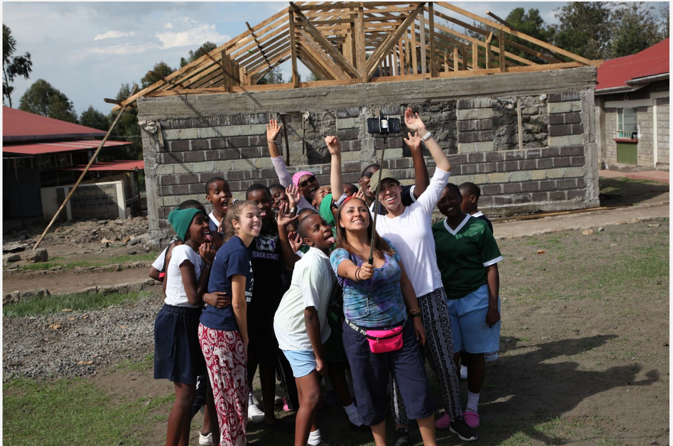
CBC missionaries and the girls taking a selfie in front of the new Science lab in progress.