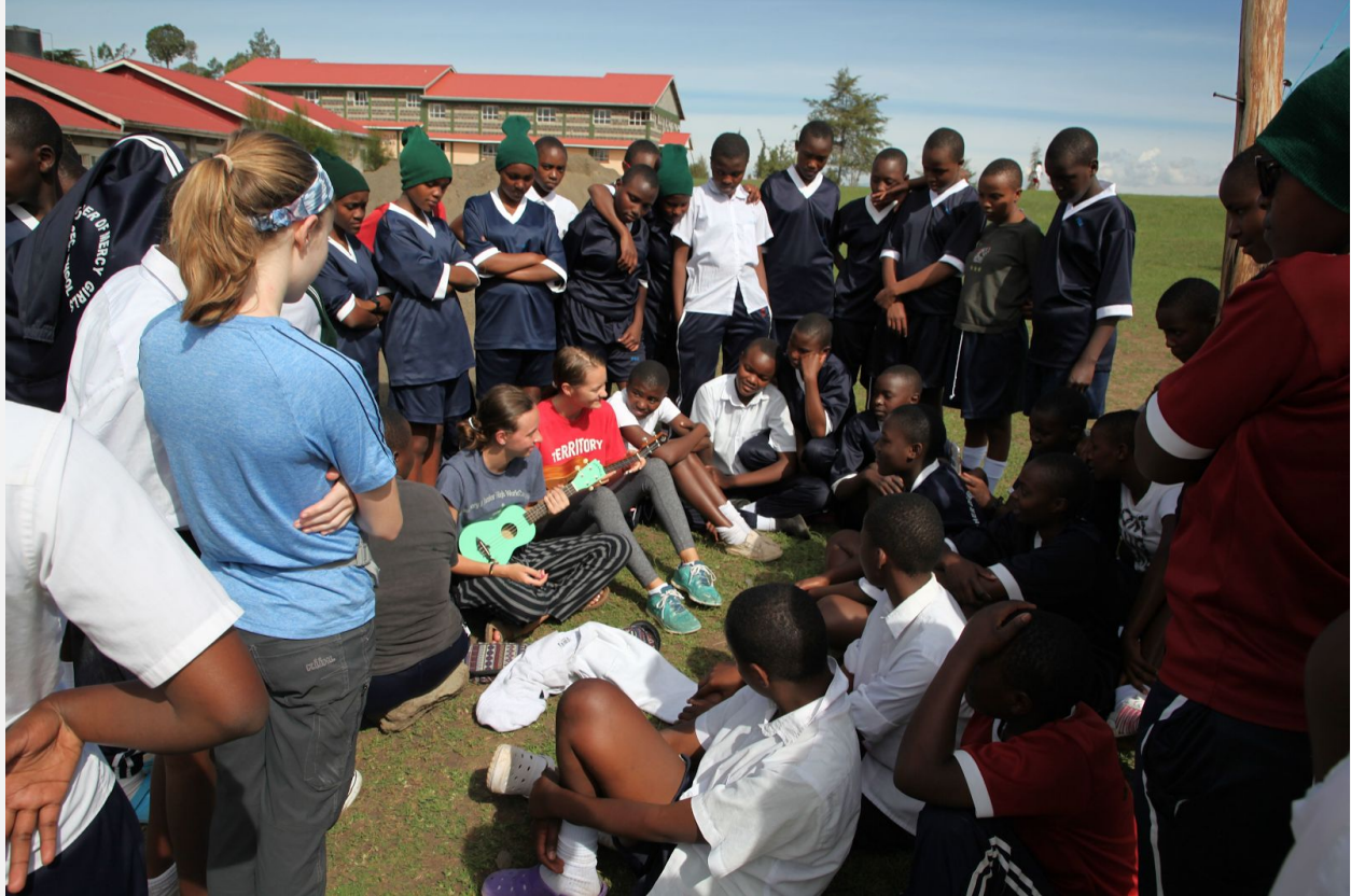
Getting to know the girls at the Mercy School through song. New dormitory is in the background.