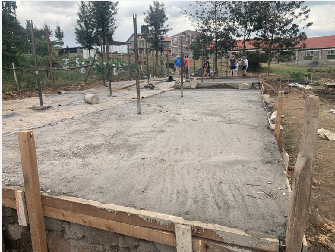
A completed foundation for a new cow barn by the CBC missionary team in July 2022!

further support the biogas project also begun in 2021 as manure waste is recycled and used to source clean energy for the school.