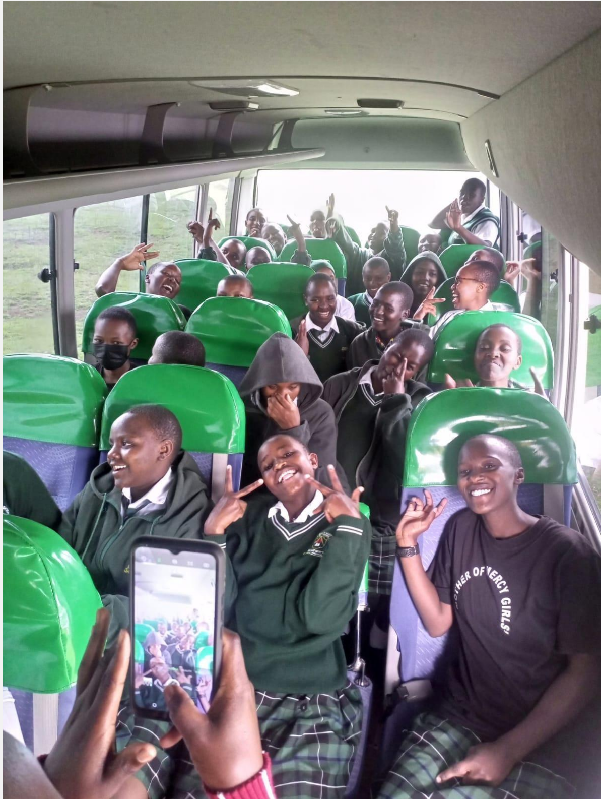
Mercy Girls express joy and smiles in their new school bus!