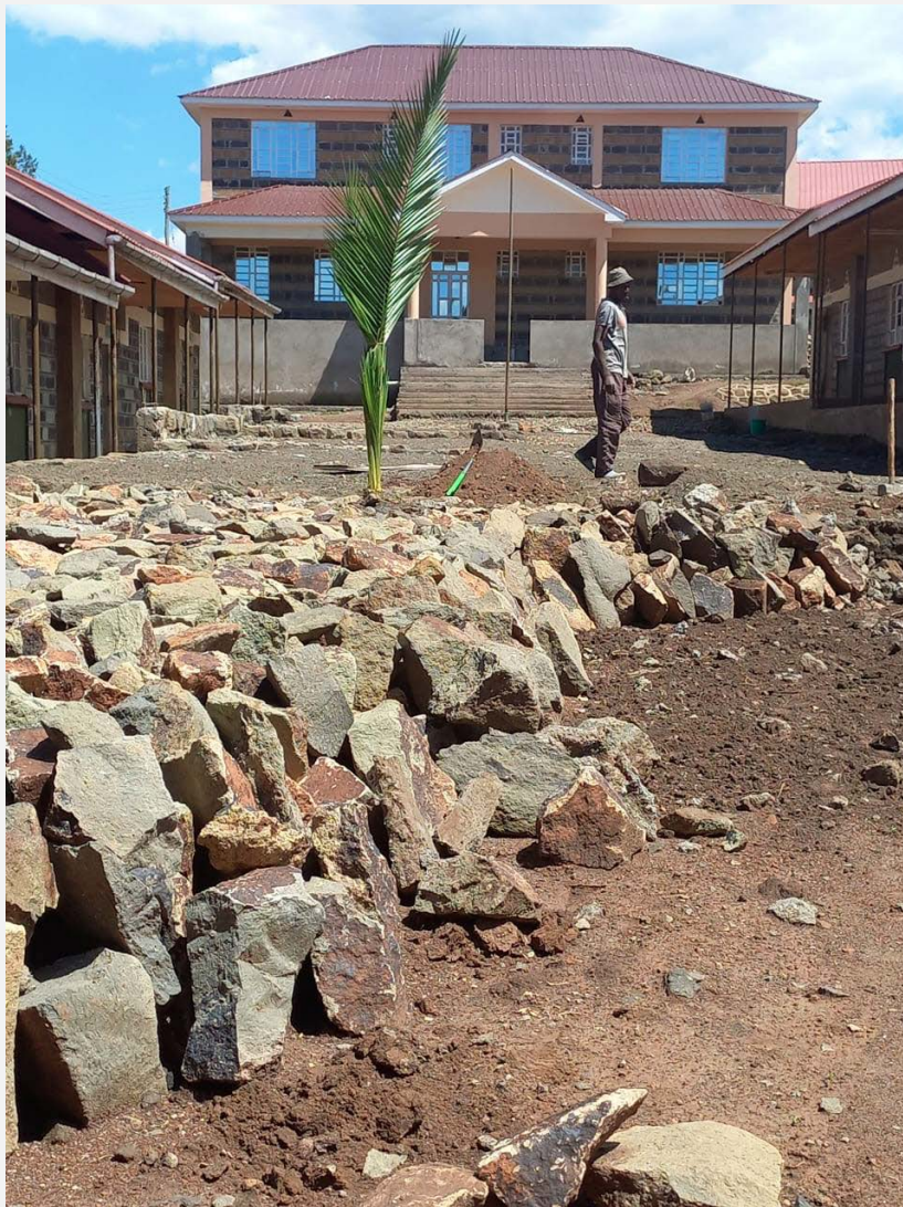
Newly completed Administration building in 2022.

The construction of the new administration building for the Mercy Girls' Secondary School which began in 2020 was completed in summer of 2022 and provides meeting space for the leadership and teaching staff of the school.