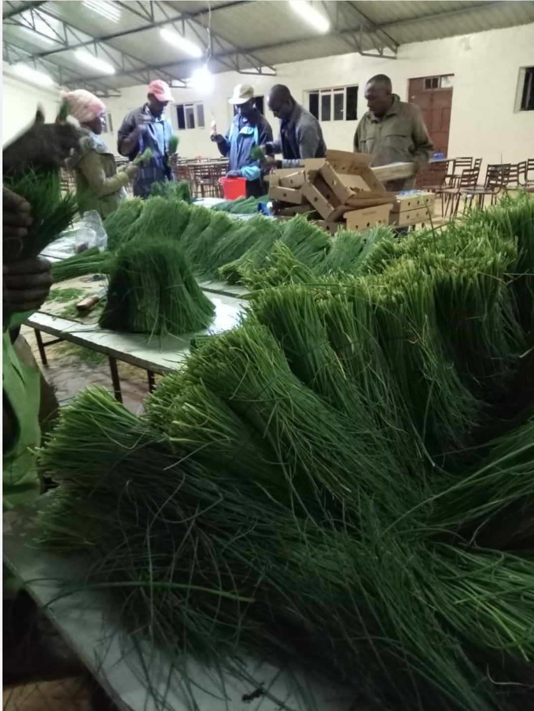
Chives being harvested for markets at the Mercy Project's Farming Program.

During the week, CBC missionaries also assisted with the cultivation of the vegetables in the greenhouses, in addition to hoeing and planting seeds in the outdoor fields.