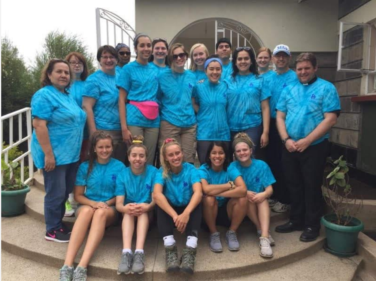
Pictured above is the 2018 Commissioned by Christ Kenya Mission team.

The missionaries focused their mornings on painting classrooms, renovating the garden areas around the school and supporting the new building efforts underway to bring water to the dormitory and the start of a science lab.